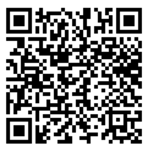
Figure 2. SHAPE America sports officials' community form.

URL: https://docs.google.com/forms/d/e/1FAIpQLSdQN b3EQPXBv4AZdvAsNl4sqbIxQgOcEsx_ yoygA5ad8cZWlQ/viewform